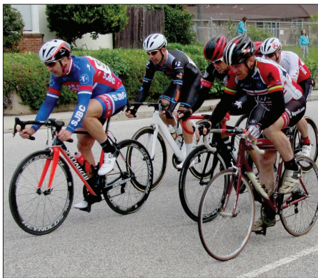
Racers approach finish of Santa Cruz Classic Criterium

The Santa Cruz Classic Criterium began as a project of the City of Santa Cruz Parks and Recreation Dept., and it is one of the three oldest criteriums on the West Coast. Planned and executed by Velo Promo