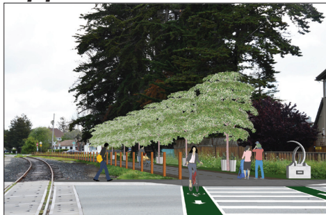
The first rail trail segment will be on the city's Westside.

The approved project, 1.36 miles long, will be a 12'-16' wide stretch of paved trail with a wire fence separating it from the railroad tracks. It will