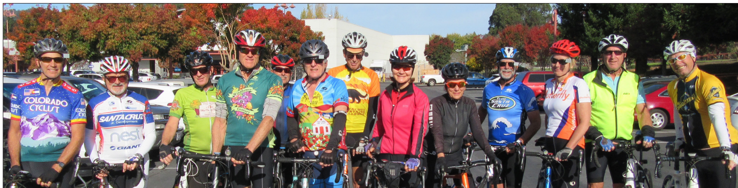
Tuesday riders meet on a November morning at Gateway Plaza